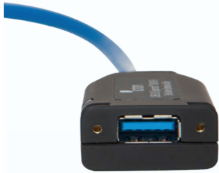
Locking USB Receptacle